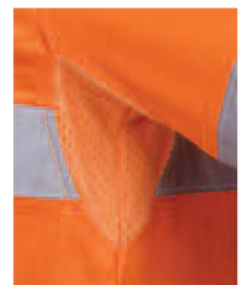
C93, C94 Underarm Vents